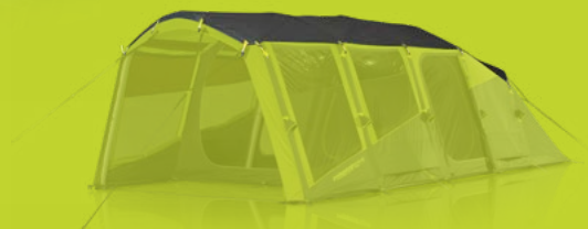
Evo TL V2 Roof Cover