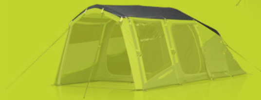
Evo TM V2 Roof Cover