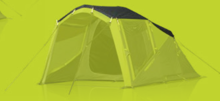
Evo TS V2 Roof Cover